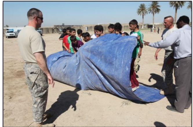
How do you get the tarp folded without stepping off of it? These young Scouts figured it out by working together.